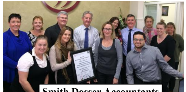
Smith Dossor Accountants