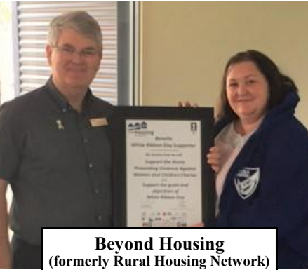
Beyond Housing (formerly Rural Housing Network)